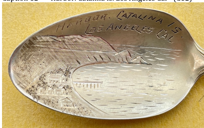
on Wallace – pattern name not currently known